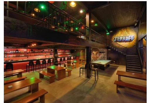
(PARADISE SUITES HOTEL, HALONG BAY)