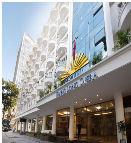
(Thang Long Opera Hotel)